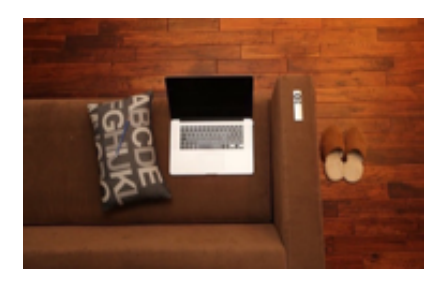
Check out our English language editing and proofreading services.